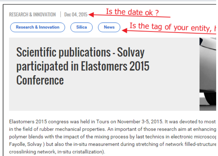
2 - Points to check

The following screen cast also show how to check which tag(s) are needed to get your news displayed in your space news stream: