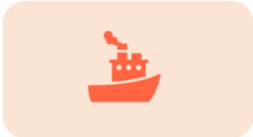
Import & Export