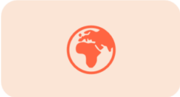
Trade & Compliance