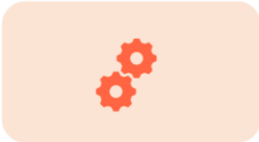
Support Office - Need Support?