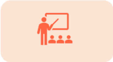
Onboarding & Training