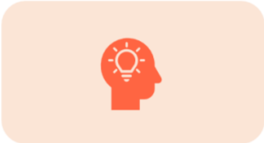
Idea Submission Form