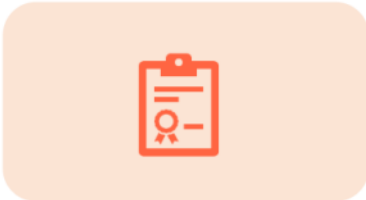
Quality & Regulatory