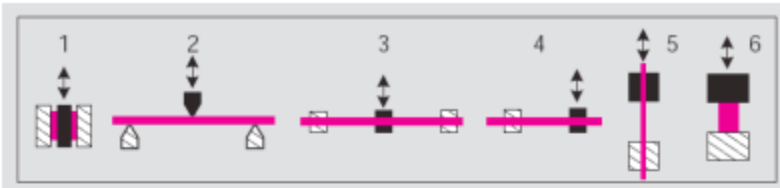
Fig. 1. DMA/SDTA861* measurement modes: 1 shear; 2 three-point bending; 3 dual cantilever (similar to bending but the sample is fixed); 4 single cantilever; 5 tension for thin bars, films and fibers; 6 compression. The clamping assembly is colored black and the sample red. The hatched areas show the parts of the clamping assemblies that remain fixed in position.

A number of different measurement modes are used: - Shear for samples with a shear modulus in a very large range from about 1 kPa to 2 GPa. This allows viscous liquids and even solid samples, e.g. polymers in the glassy state, to be measured. - Three-point bending for stiff samples with a modulus of elasticity of up to 1000 GPa. - Single and dual cantilever bending for samples that deform too strongly with three-point bending. - Tension for thin bars, films and fibers. - Compression for samples with a modulus of elasticity of up to about 1 GPa