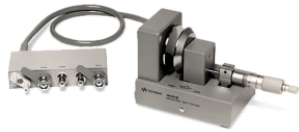
Partial Discharge Inception Voltage (PDIV)