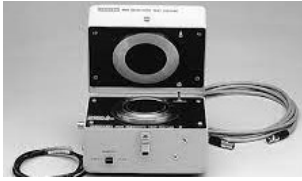
Dielectric Spectroscopy at Low Frequency