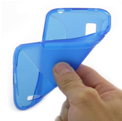
Reactive Extrusion Applications