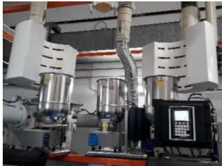
Bollate (Engineered Materials)