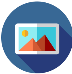
Images and Template