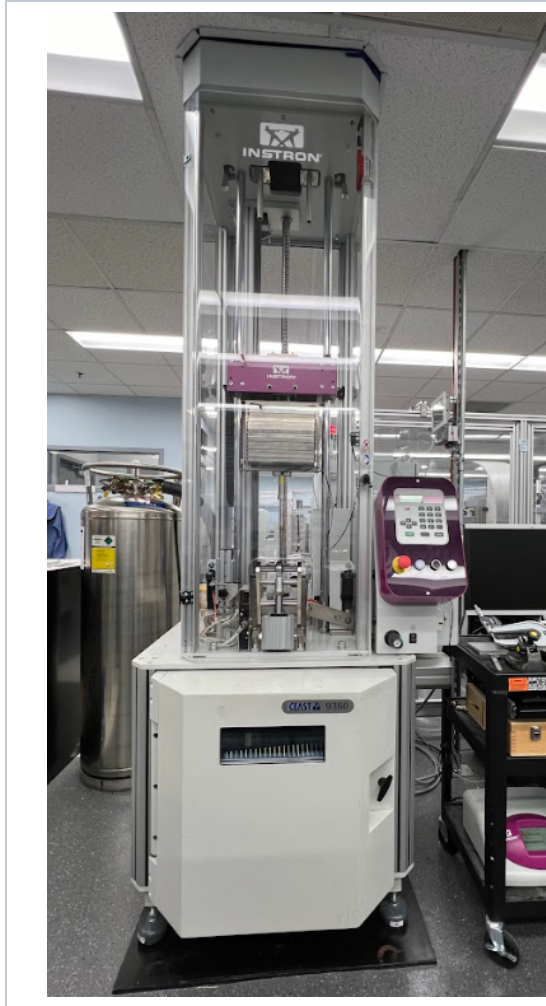
CEAST 9350 Multi-axial Impact