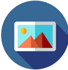
Images and Template