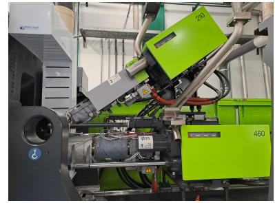
Engel Victory 460H/210W/220 combi