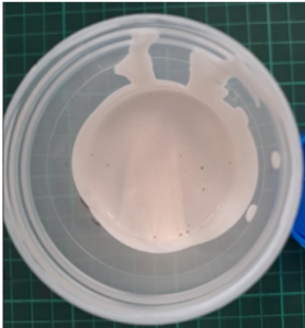
PEEK Slurry Prototype (Without non-stick properties)