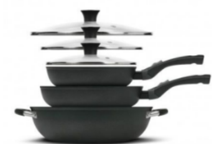
Commercial Pans Tear Down