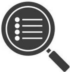
Table of content