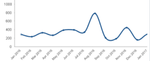
Contracts maintenance by month

Refresh Frequency: 3 times per month (1st, 5th and 26th) *Loading M-1 Results