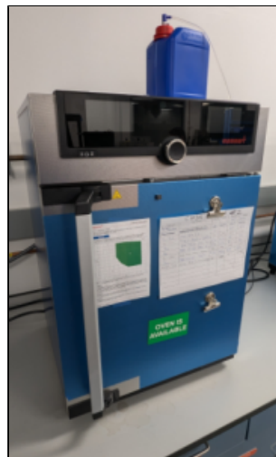
Relative Humidity Conditioning