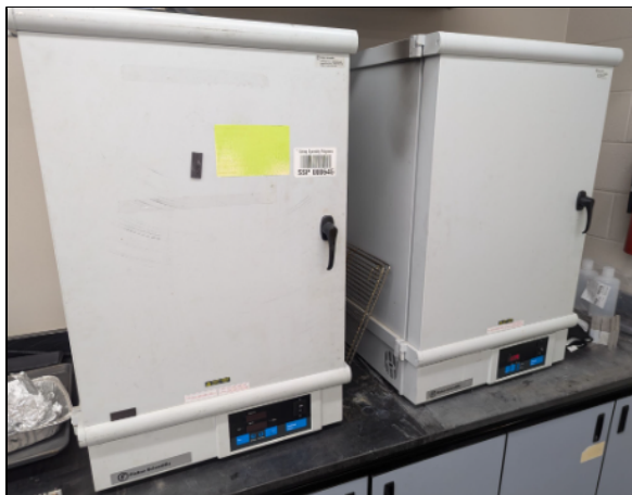
High Temperature Oven Conditioning