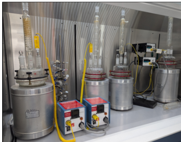
Atmospheric Pressure Water Solution Immersions