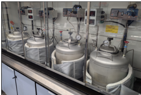
Sealed Heated Immersion Vessels