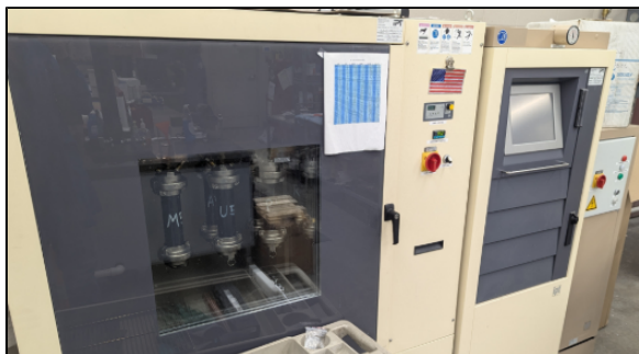
Long Term Hydrostatic Stability (LTHS)